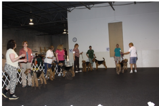
Fun Day 2010