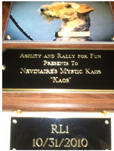
Newsletter - March 2011